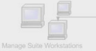
Manage Suite Workstations

AUDITOR CALCULATE CONFIGURABLE DOWNLOAD INVENTORY MANAGESUITE SUITE